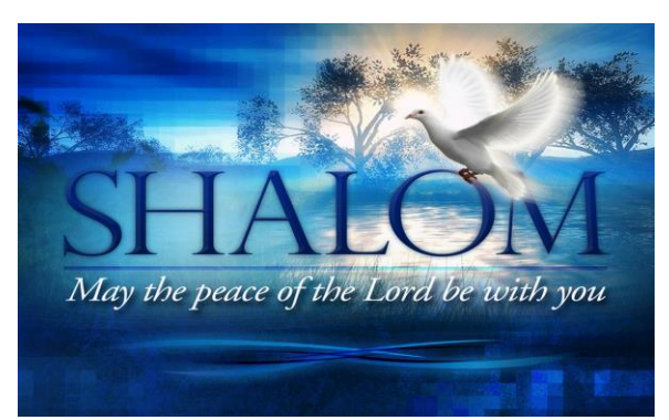
WHEN SCIENCE CATCHES UP TO BIBLICAL TRUTHS BENEFITS OF SHALOM