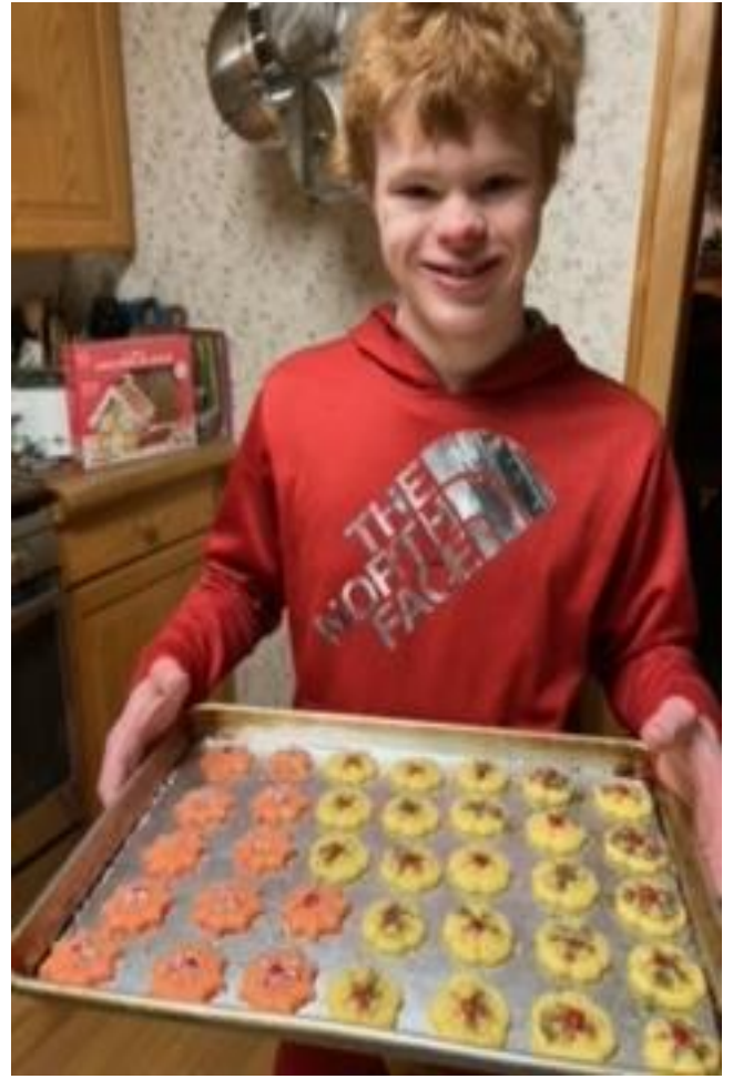
The Healys... um! Um! Good!