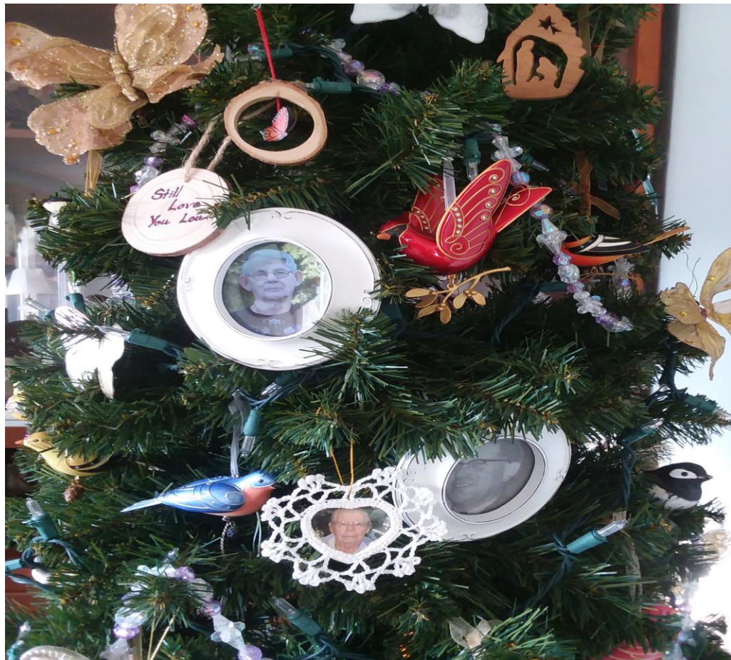
Donna's Christmas Tree of Remembrance